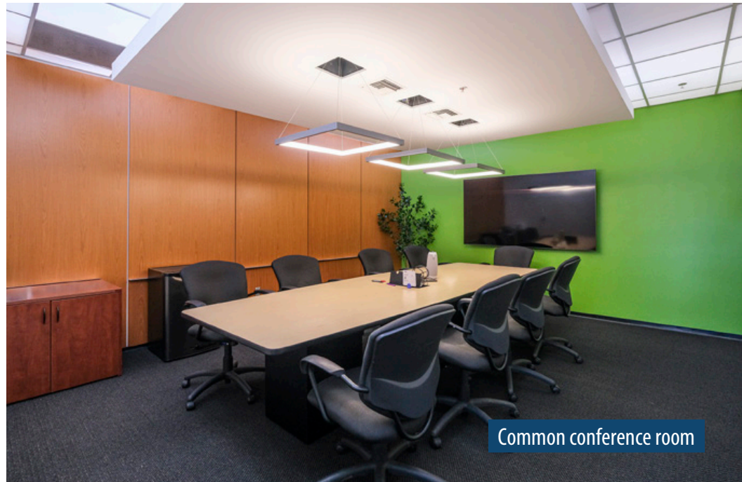
Common conference room

Experience. Integrity. Trust. Since 1993