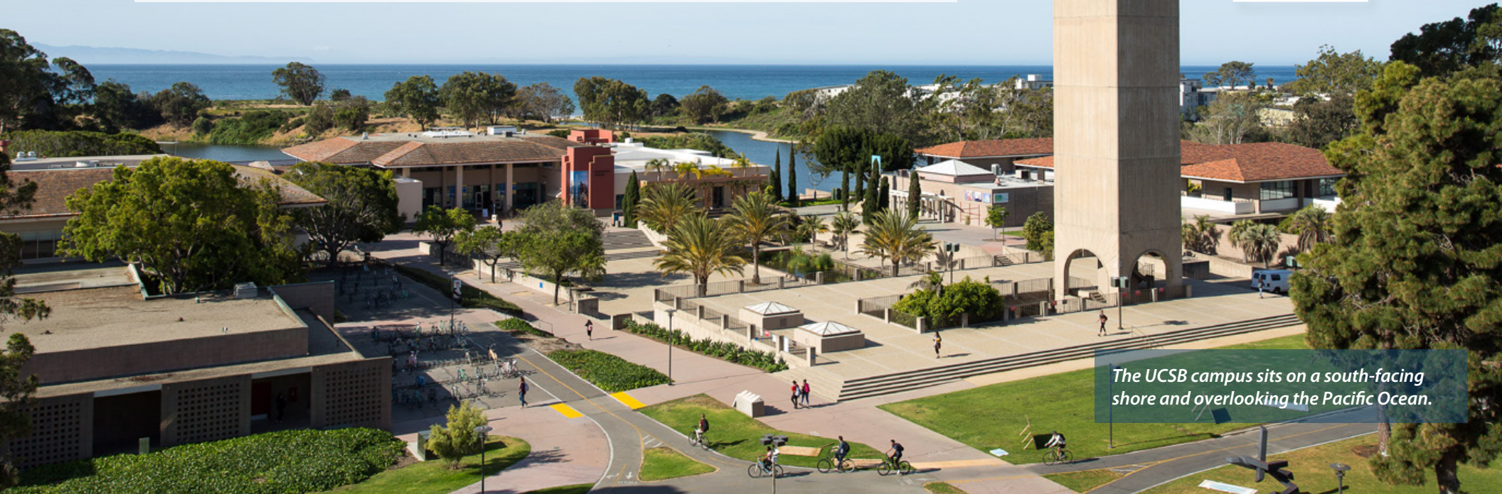
The UCSB campus sits on a south-facing shore and overlooking the Pacific Ocean.

Experience. Integrity. Trust. Since 1993