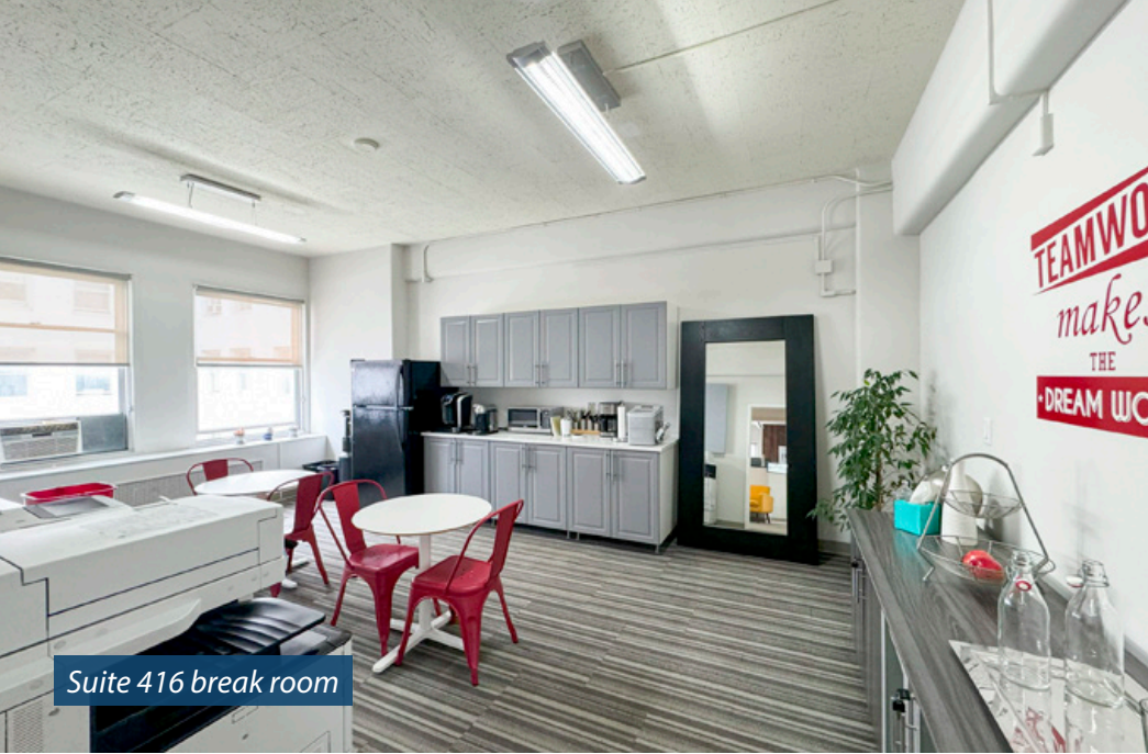
Suite 416 break room