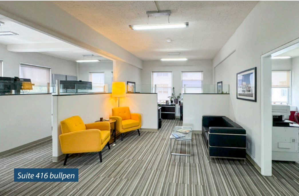
Suite 416 bullpen