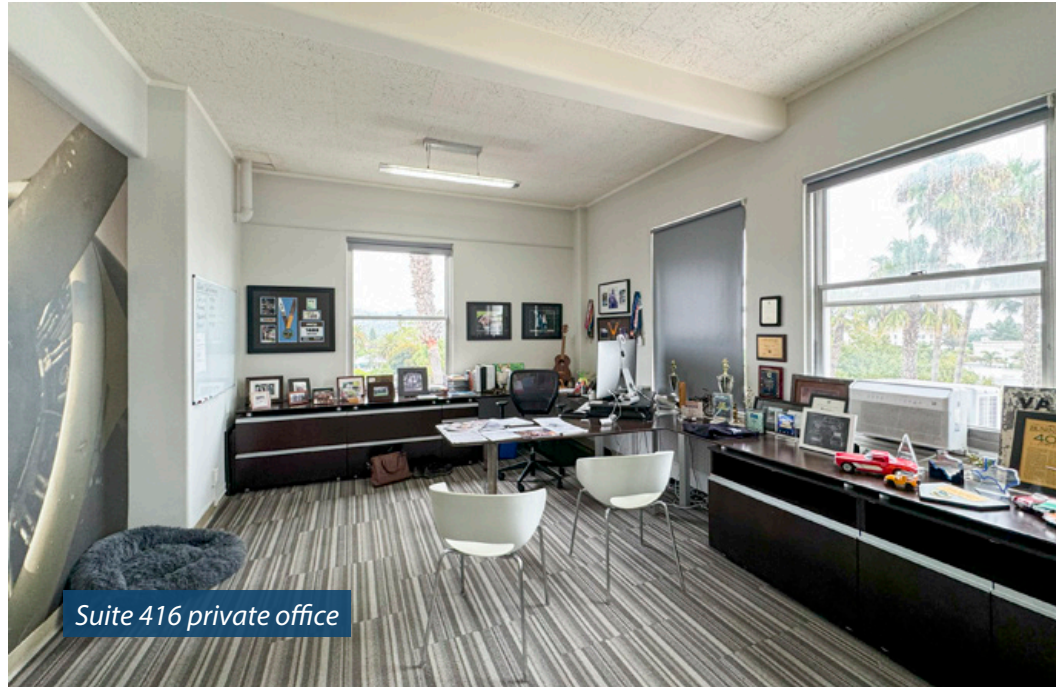
Suite 416 private office

Experience. Integrity. Trust. Since 1993