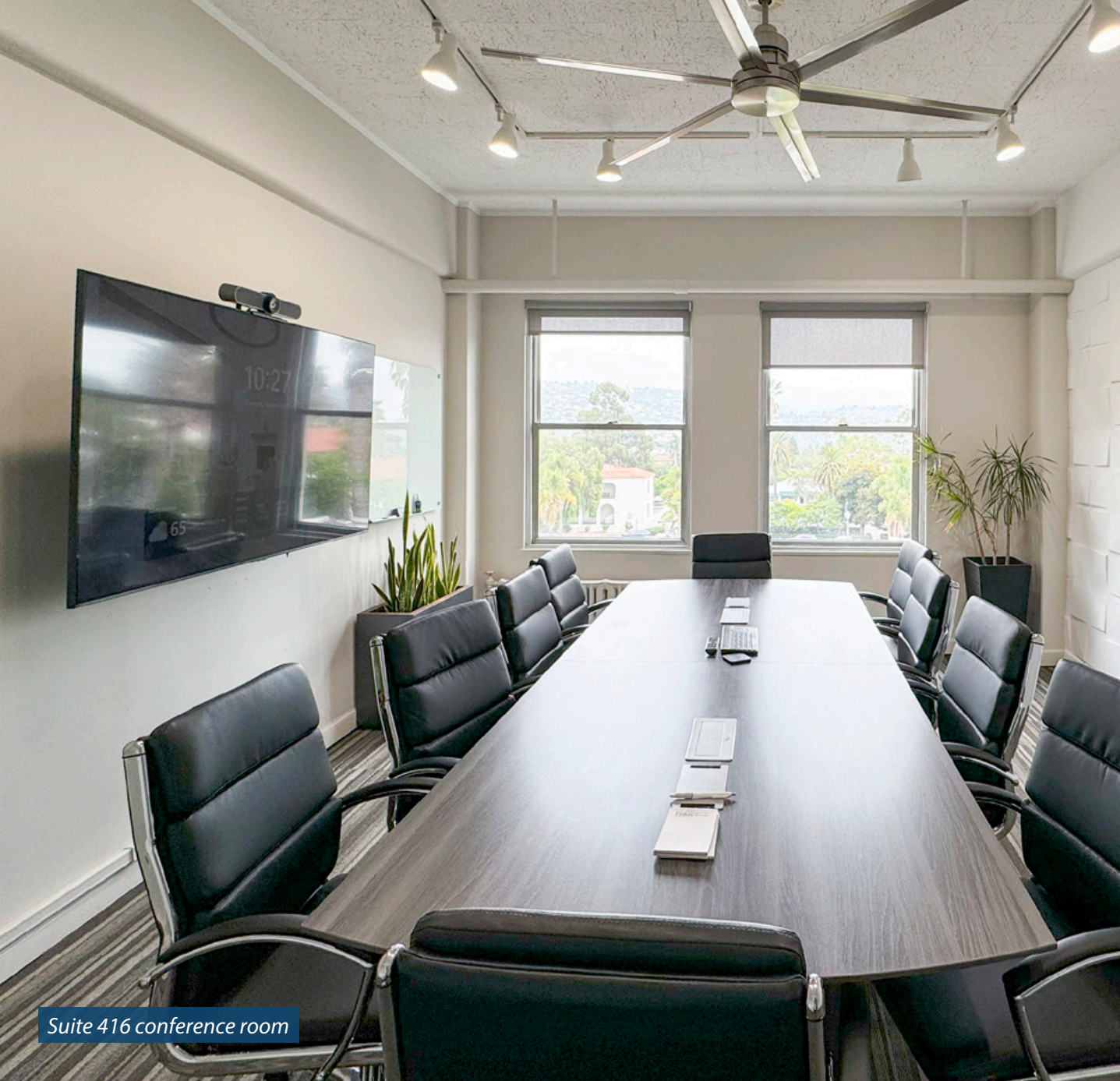
Suite 416 conference room