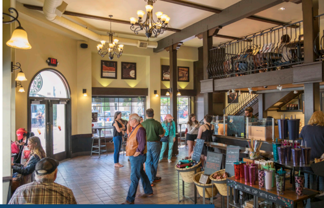
Note: Photos taken during previous tenancy. Space is currently in shell condition, with improvements underway.