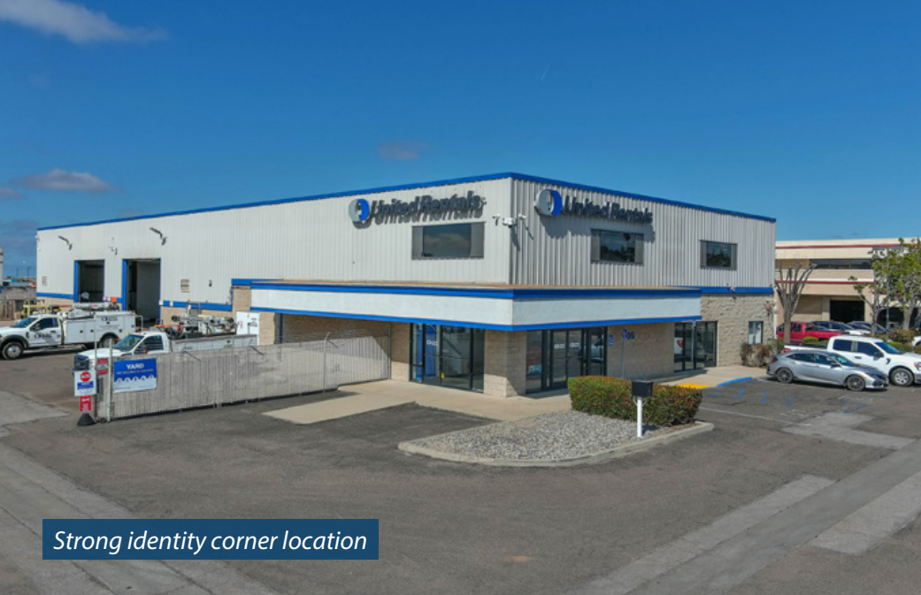
Strong identity corner location