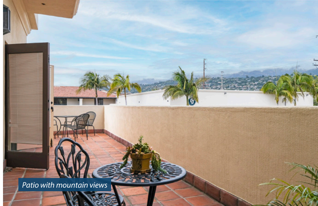
Patio with mountain views