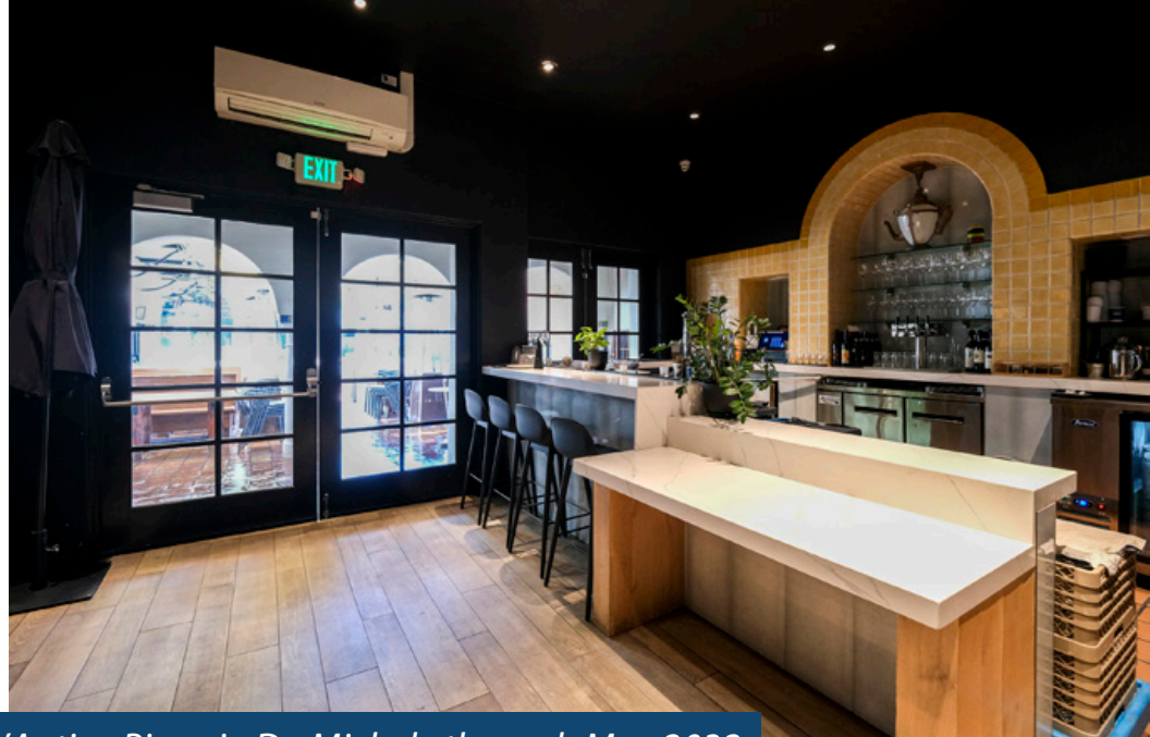
1031 State St — 2,508 SF restaurant, lease to L'Antica Pizzeria Da Michele through May 2032